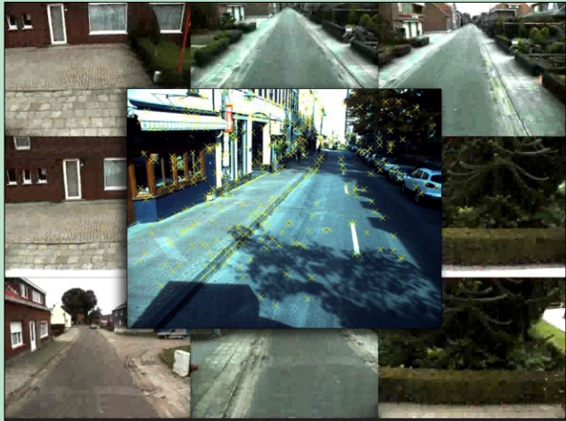
Multi images with processed single image feature point cloud

The processed imagery is easily integrated into Auto CAD, Microstation, ArcGIS and other CAD systems providing a valuable resource to Asset Managers, Engineers and Designers, Mapping and GIS Specialists, City Inspectors and Urban Planners. The system is simple, fast and economical.